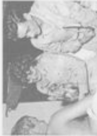
Smoky is held by an American Red Cross nurse while visiting sick and wounded soldiers at the 120 th General Hospital at Santo Tomas University campus, in the Philippines, June 1945. Smoky is the first therapy dog of record.